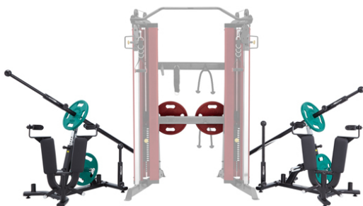
Dual Renegade Kit (CLDCC2)